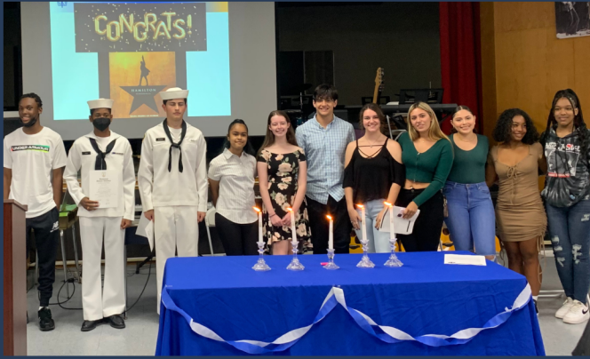
NATIONAL HONOR SOCIETY INDUCTION