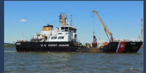
10th Grade visit to USCG William Tate