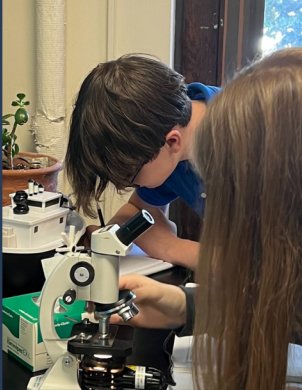
PLANTS VS ANIMALS LAB (RIGHT)