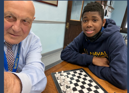
MINDING YOUR MIND PRESENTATION (LEFT) 8TH GRADE VISIT (ABOVE) CHESS CLUB (RIGHT)