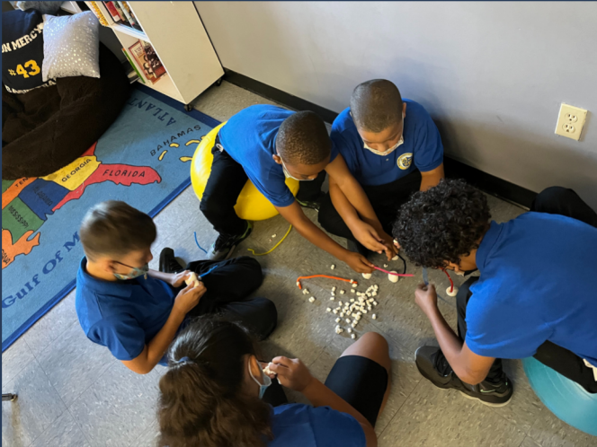
4TH GRADE STEM PROJECT